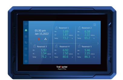
NFS-3 for Aqua-X Plus Control System

The Aqua-X Plus (NFS-3) is a professional-grade multi-zones irrigation control system. It has an 800x480 7" LCD touch-screen monitor, features multiple advanced pump and solenoid control functions, and has greatly expanded device control capacity.