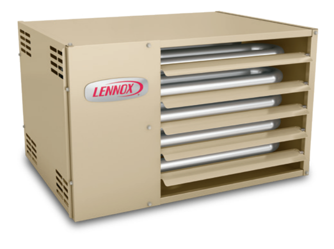
*Only compact models can be installed 180°

Lennox heating products are available in three unit designs to meet a wide range of commercial and residential applications. With fourteen available heating capacities, it's easy to find the right size heater to keep your spaces comfortable. Horizontal and vertical wall venting options, as well as the 180° installation* capability, allow the units to be placed in a number of locations.