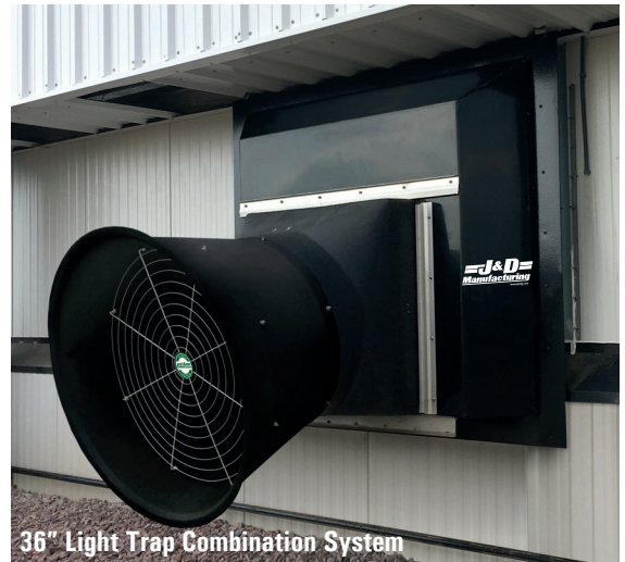
36" Light Trap Combination System

Don't waste space and money building a light trap wall