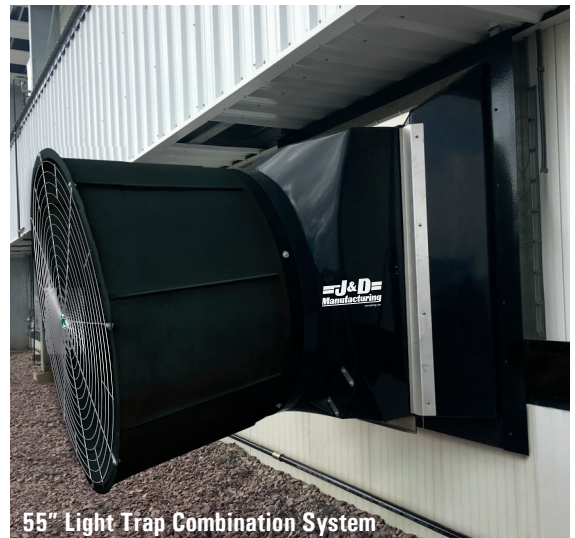
55" Light Trap Combination System