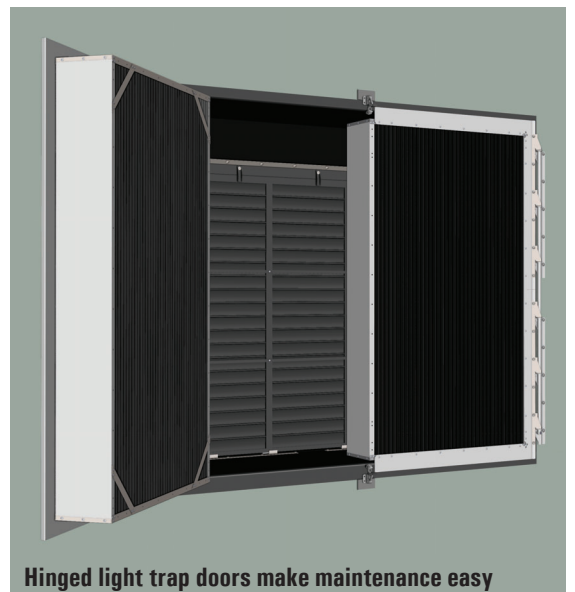
Hinged light trap doors make maintenance easy

⚠ WARNING: This product can expose you to chemicals including chromium, which is known to the State of California to cause cancer and birth defects or other reproductive harm. For more information go to www.P65Warnings.ca.gov/product .