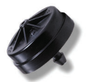
PRESSURE COMPENSATING (PC) NON CNL