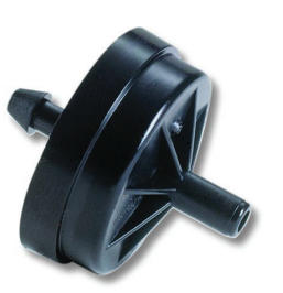
WOODPECKER PRESSURE COMPENSATING (WPC) NON CNL