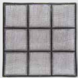
NFS13 WASHABLE NYLON MESH FILTER