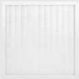
HEPA65-33 HEPA FILTER