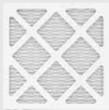
PF13 PLEATED MEDIA FILTER