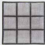
NFS13 WASHABLE NYLON MESH FILTER