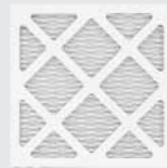
PF13 PLEATED MEDIA FILTER