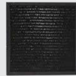
CF15 ACTIVE CARBON FILTER