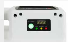
PM2.5 Air Quality Sensor Panel