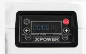
Digital Control Panel