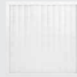
HEPA50-33 HEPA FILTER