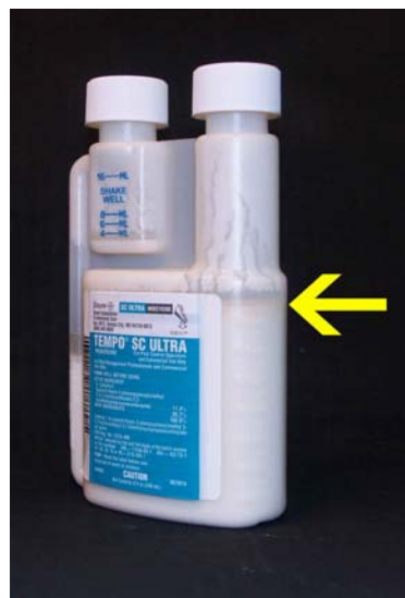
Fig. 2. Example of separation or settling out of solid particles for Tempo SC Ultra Insecticide.

Disadvantages for SC formulations are few. There can be minor separation or "settling out" that occurs in the SC container while in storage (especially if stored in extreme heat or cold). After a couple months in storage a minimal amount of the solids may settle out (Fig. 2).