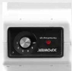
5 Speed Control Panel