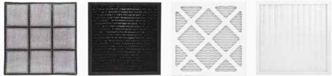
NFS16 WASHABLE NYLON MESH FILTER CF35 ACTIVE CARBON FILTER PF16 PLEATED MEDIA FILTER HEPA50 HEPA FILTER

FILTER CHANGE LIGHT Indicates when filter needs to be cleaned or changed.