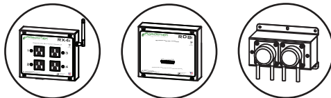
RX Outlet Relays RD Dry Contacts AD Dosing Pumps