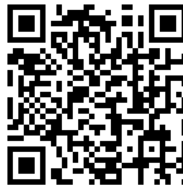
CAPTURE THIS QR CODE WITH YOUR SMARTPHONE !

QUESTION #1: I think my controller is damaged, or it simply does not work as indicated in the user guide, what should I do ?