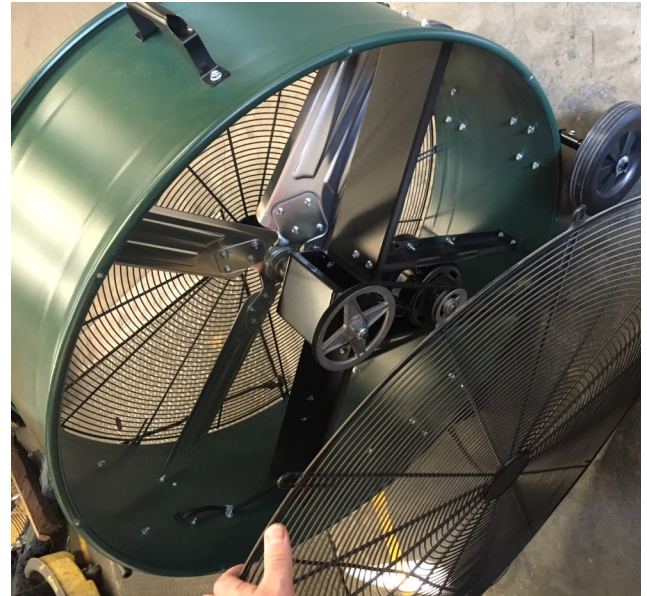
STEP 2: REMOVE BACK GRILL