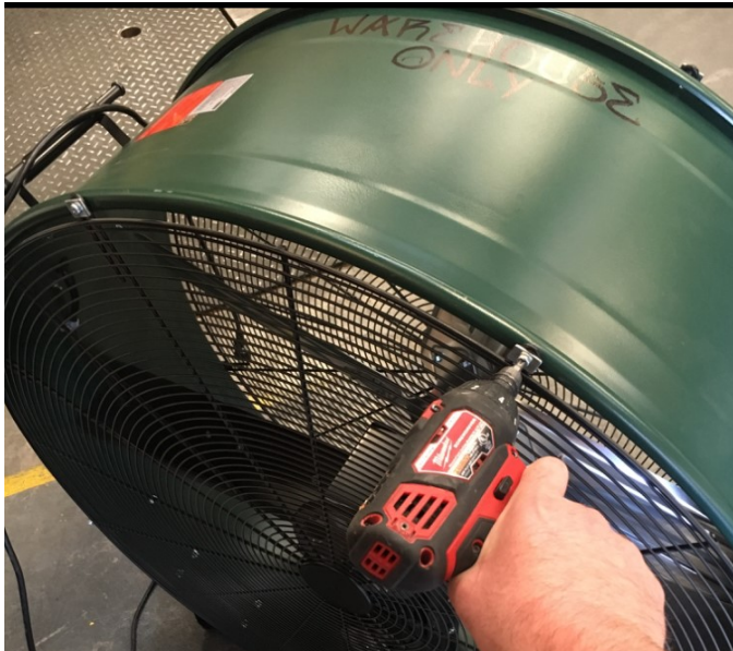
STEP 1: REMOVE SCREWS AND WASHERS FROM BACK GRILL