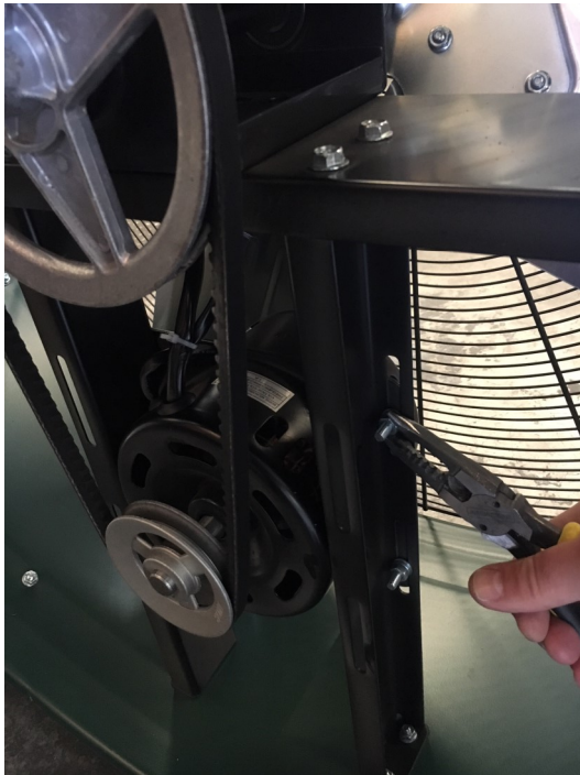
STEP 3: LOOSEN 4 BOLTS THAT SECURE THE MOTOR TO THE FRAME