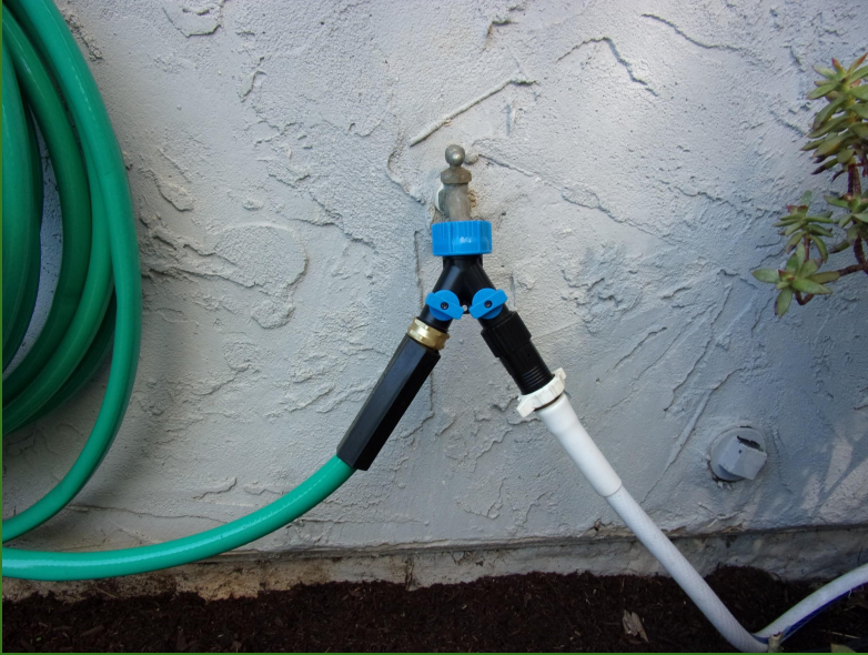
Standard manual setup