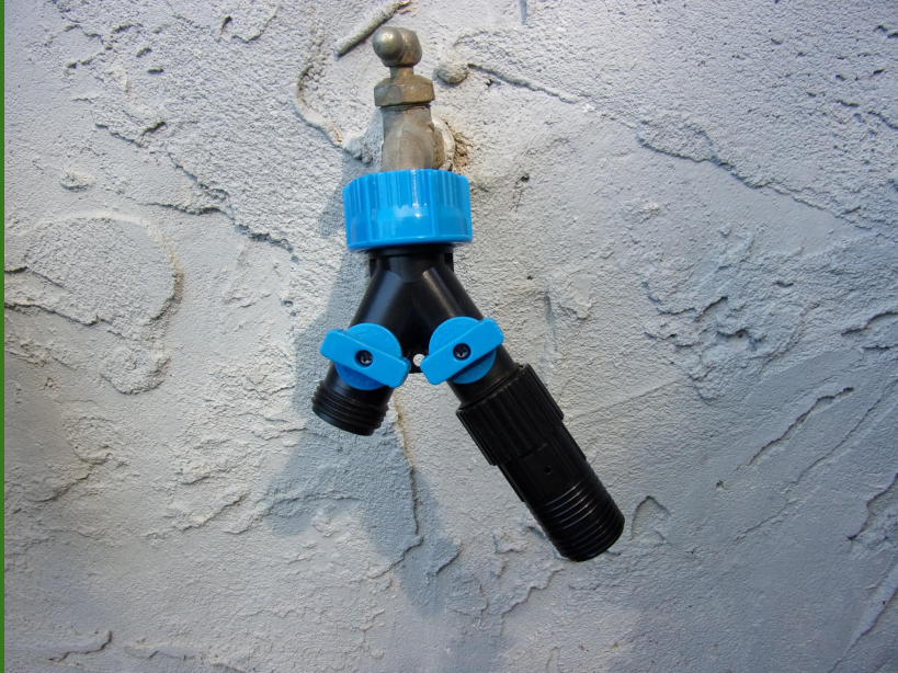
The pressure regulator screws onto the splitter