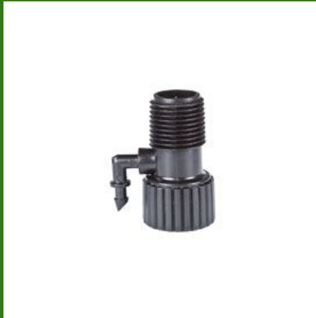
½” Riser Adapter

The Living Wall kit includes adapters to connect the drip system to a ½” sprinkler riser, outdoor faucet, or garden hose. This presentation will connect to a garden hose