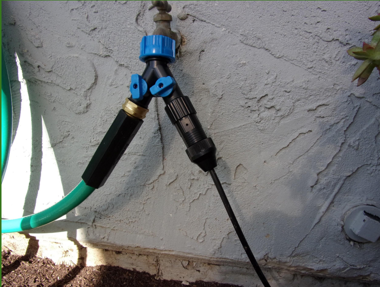
Manual setup without timer