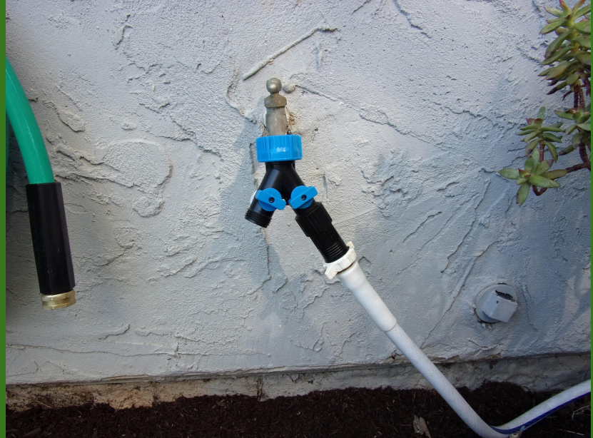
The white hose supplies water to the Living Wall