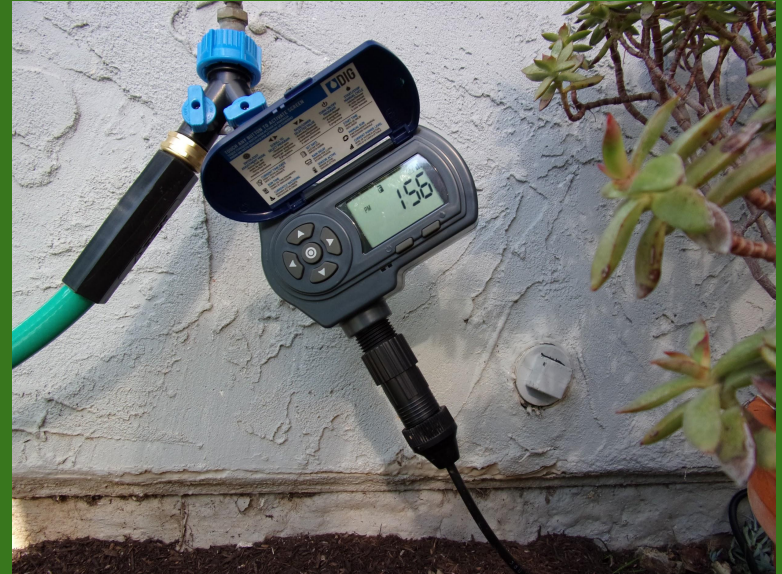
Automated with DIG EVO 100 Solar timer

The 1/4" adapter can also be connected directly to the pressure regulator