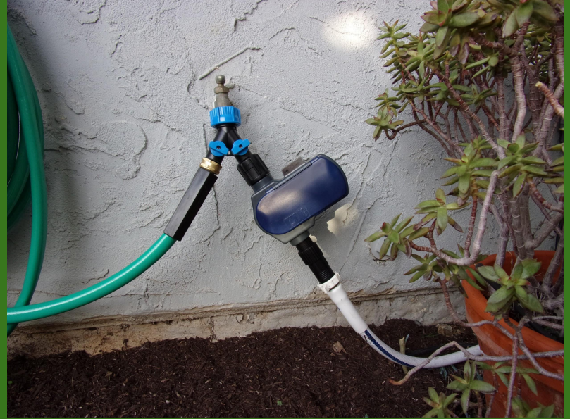
Automated with DIG EVO 100 timer