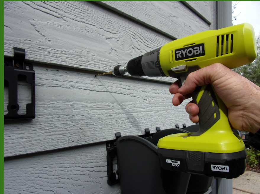
Drill screw holes ( \frac{1}{8} " bit)