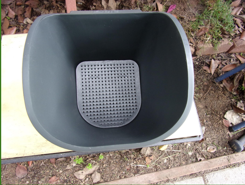
Place drainage screen in bottom of pot