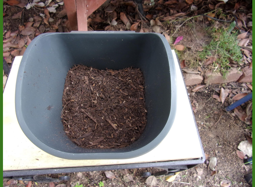
Add potting soil