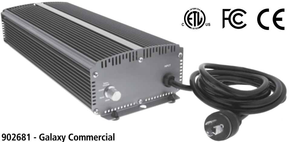
902681 - Galaxy Commercial 1000 WATT 277 V Ballast